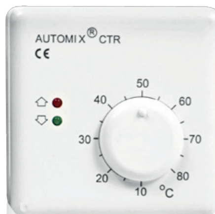
AUTOMIX CTR room controller unit